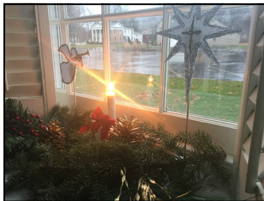
A window in the Sanctuary decorated for Advent and Christmas. The children made the angels and stars during our "decorating party" after Thanksgiving.

Two of the greatest sources of information about the activities of our Middleburgh Reformed Church during the first years of the 21st Century are the monthly calendars and the semi-annual newsletters. Many thanks to those people who assemble, print and distribute these sources of information. They are carefully filed for future reference.