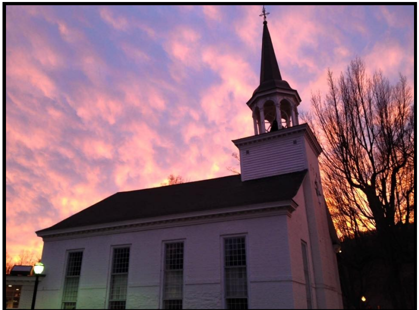
Sunset. February 2016

We welcome anyone who would like to be part of the Property Committee.