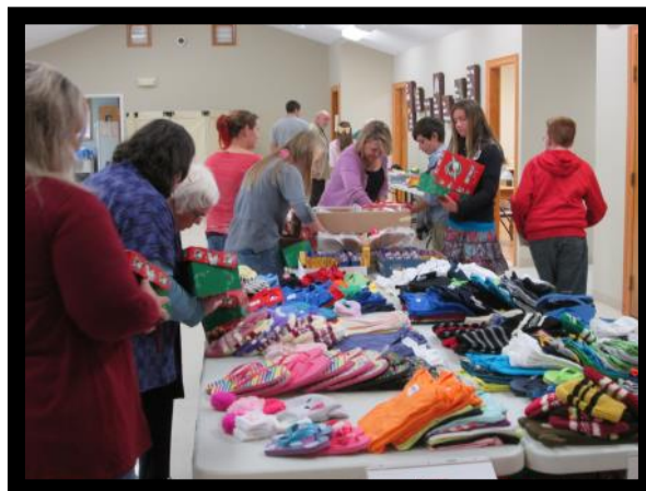
Above: Members of the congregation get to work at the Annual Packing Party.

The congregation prays over the boxes before they are loaded into shipping cartons.